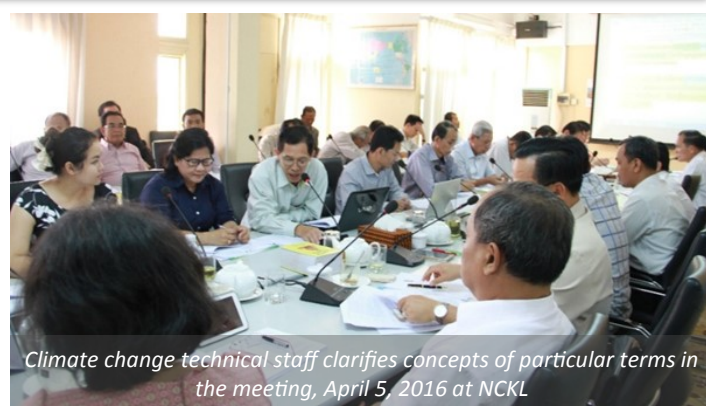
Climate change technical staff clarifies concepts of particular terms in the meeting, April 5, 2016 at NCKL

The glossary team, formed by NCKL members and DCC, CCCA and SPCR experts, has been meeting regularly every Tuesday and Wednesday, since 30 th March, to provide a