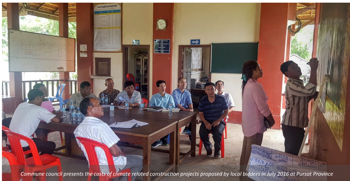
Commune council presents the costs of climate related construction projects proposed by local bidders in July 2016 at Pursat Province

CCCA has learnt that PDoEs and Communes have shown high enthusiasm to address climate change in their locations. At the same time, it is evident that sub-national authorities including communes face some challenges due to their limited capacity to identify suitable adaptation options, requiring further technical support from climate change experts. Although each commune is entitled to receive Commune/Sangkat Fund, the opportunity for implementing the climate change projects in CIP still relies heavily on funds from local NGOs, development partners and other interest groups. The scale up NCDD-S and DCC's efforts on mainstreaming climate change into sub-national planning and budgeting processes will require a great deal of support, making the dissemination of the current approach to a broader range of stakeholders a crucial step towards their engagement and scaled up support.