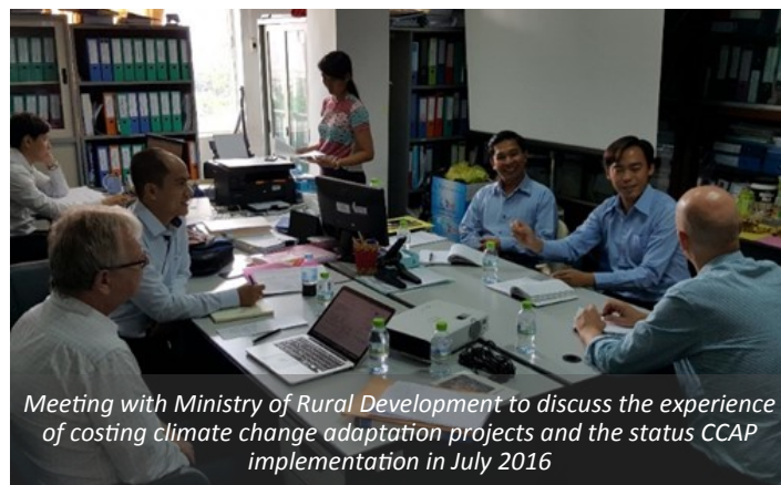
Meeting with Ministry of Rural Development to discuss the experience of costing climate change adaptation projects and the status CCAP implementation in July 2016

Other findings and recommendations from the costing exercise were: