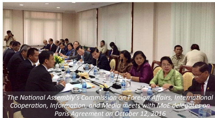
The National Assembly's Commission on Foreign Affairs, International Cooperation, Information, and Media meets with MoE delegates on Paris Agreement on October 12, 2016

The Royal Government of Cambodia, having signed the Paris Agreement on 22 th April 2016 at the UN Headquarters in New York, is now in the process of ratifying the Agreement. The Department of Climate Change (DCC) of the General Secretariat of the National Council for Sustainable Development, being the focal point to the UNFCCC, has been assisting the Government throughout the ratification process. The translated text in Khmer of the Paris Agreement, produced by DCC, was already reviewed by the Council of the Ministers and subsequently submitted to the National Assembly. On the 12 th October 2016, the Assembly's Commission on Foreign Affairs, International Cooperation, Information, and Media placed the ratification of the Paris Agreement as item in the agenda for the next general meeting of the Assembly to be held in December. Once endorsed by the Assembly, the Paris Agreement will be discussed at the general meeting of the Senate and to be then submitted to His Majesty the King of Cambodia for signature, before the Country deposits its ratification instrument with the