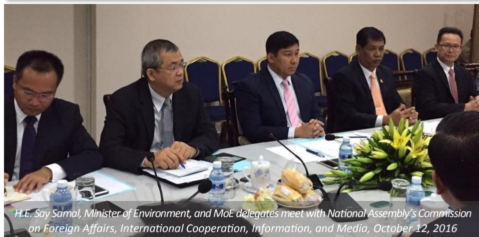
H.E. Say Samal, Minister of Environment, and MoE delegates meet with National Assembly's Commission on Foreign Affairs, International Cooperation, Information, and Media, October 12, 2016

The United Nations Framework Convention on Climate Change (UNFCCC) achieved one of the most significant agreements in its over 20 years of global negotiations at the 21 st Conference of the Parties (COP21) in Paris last year – the Paris Agreement. The purpose of the Paris Agreement is 1) to keep global temperature rise this century well